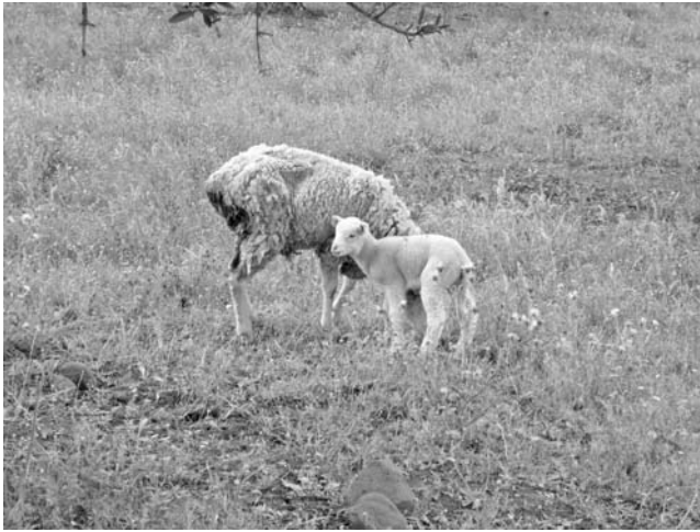
Fig. 5.1. Ewe with Haemonchus contortus infection.

have been grazed by young cattle or ewes are no longer safe. N. battus has now been found to be resistant to benzimidazole anthelmintics in the UK (Mitchell et al. , 2011). However, at the present time the benzimidazole anthelmintics are still recommended for treatment of N. battus as resistance is not yet widespread.