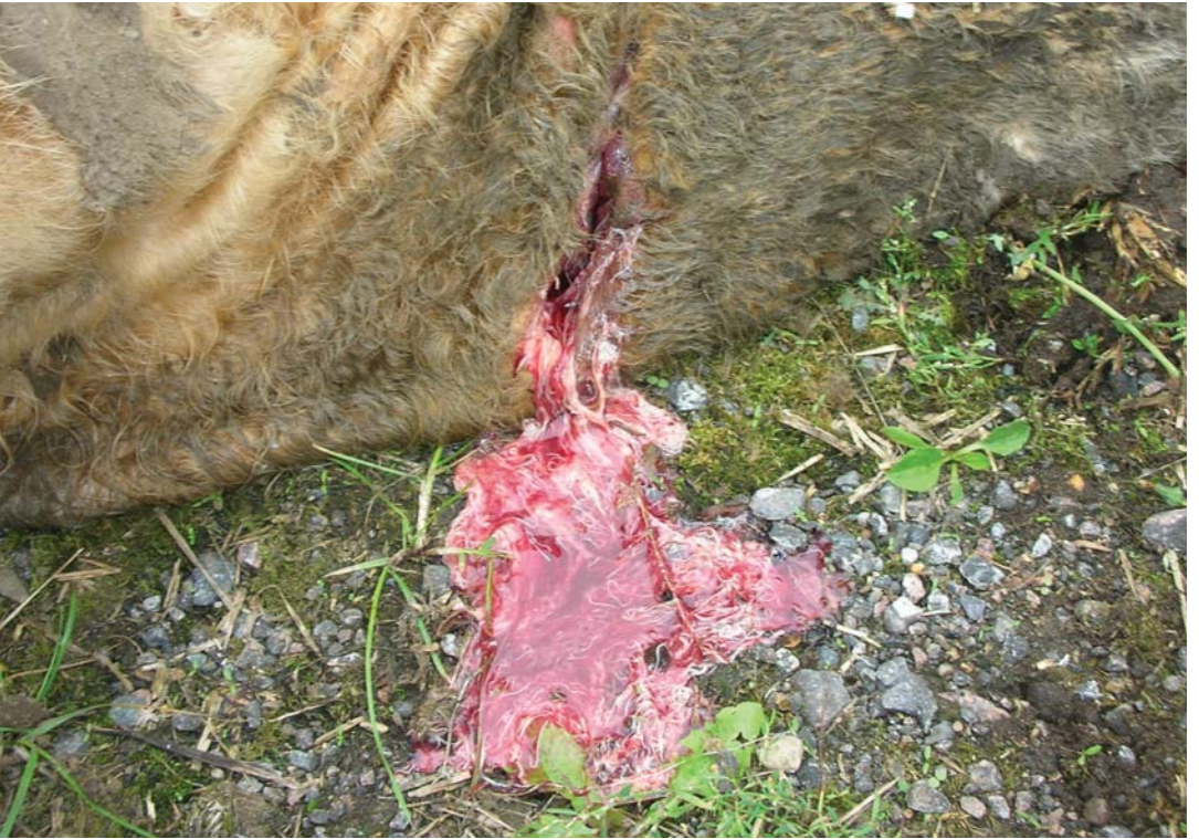
Plate 1. Oat flight on the cornea in a cow.