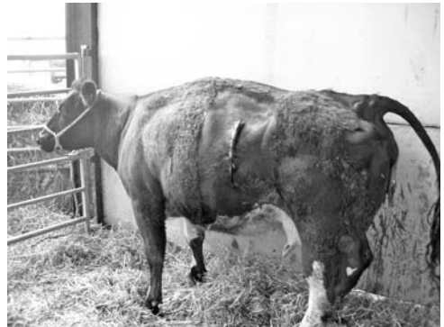
Fig. 4.3. Caesarean section in a cow: the final incision is sprayed with oxytetracycline spray.