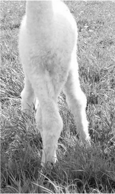
Fig. 8.2. Angular limb deformity in a cria. No immediate action should be taken.

deformity, of the tarsus and the metatarsus. If the carpus or the tarsus is deformed, euthanasia should be advised.