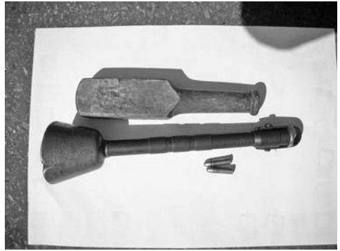
Fig. 4.7. A .310 bell gun for euthanasia.

It must be remembered when using a shotgun that the end of the barrel needs to be a minimum of 6 in. from the skull and can be up to 3ft away. A 4.10 shotgun would be suitable for a calf. The location of the position is the same for a firearm or a shotgun. It is a point in the middle of a cross made between the ears and the eyes on the opposite side of the face. The position of any horns should be