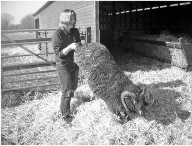
Fig. 5.2. The 'wheelbarrow' test in a sheep.

may play a part too. The chill factor is very important. On hills with rocks and deep heather the lambs can get shelter. On arable land, when fenced away from the hedgerows there is a marked chill factor. Animals may be found dead or vigilant shepherds may pick them out in the early stages of the disease when they have a high temperature and a nasal discharge. Coughing and an ocular discharge can also be a feature.