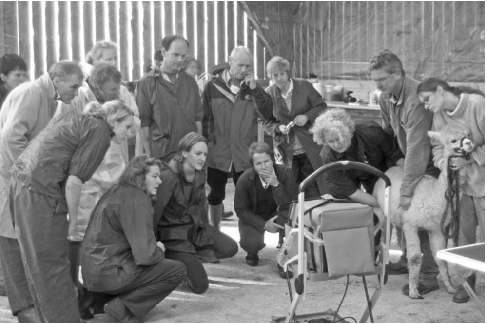
Fig. 8.1. Trans-abdominal ultrasonography of a camelid.

be pressed firmly high up in the inguinal region. The left or right side may be used at this stage. After locating the bladder the uterine bifurcation should be visualized.