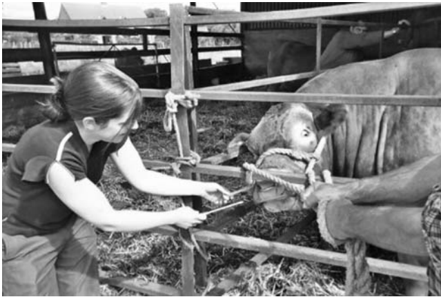
Fig. 4.6. Bull well secured with two halters through a gate before insertion of a bull ring.

Haemorrhage will be extensive and needs to be controlled, although the author has never encountered death or other problems from loss of blood except at 10 days after the operation when infection caused a total slough and death from exsanguination. Haemorrhaging can be controlled in several ways: (i) with hot irons, which has the added advantage of reducing pain as the nerve endings are destroyed; (ii) by a tourniquet of string around the crown of the head and tied between the horns, which is fairly effective but has the disadvantage that a certain amount of horn needs to be left to tie the tourniquet and this must be removed in 24 h; (iii) by ligaturing the corneal artery as it runs ventral to the horn, which can only realistically be carried out if the horn has been removed with a wide margin of skin by sawing; and (iv) by blocking the arteries as they emerge from the corneal bone with matchsticks.