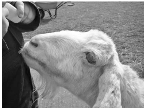
Fig. 6.5. Enucleation should be considered in any case where there is no chance of an eye condition or disease recovering.

In all cases where there is no chance of the eye condition in any disease or traumatic problem recovering, enucleation should be considered on welfare grounds (Fig. 6.5). This can be carried out under heavy sedation, normally with xylazine. Local anaesthetic should be instilled all around the orbit, not only under the skin but into the deeper tissues, by means of a single very deep injection of 5 ml behind the eye to block the optic nerve. The eyelids should then be sutured together and the whole area clipped and prepared aseptically. A careful incision is then made through the skin parallel to the upper eyelid margin but not entering the conjunctival sac. Using blunt dissection the eye muscles are sectioned around that half of the eye. The same procedure is then carried out to