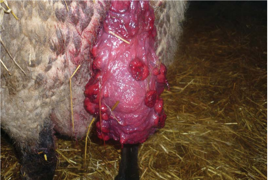
Plate 9. Goat with rhododendron poisoning.