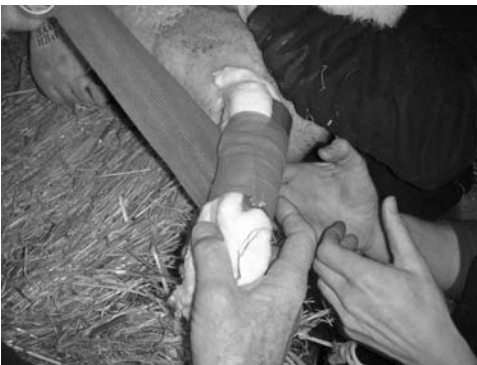
Fig. 6.8. Splinting a fracture in a lamb.

Surgical removal of the digit is a more humane option (Fig. 6.9). It is vital that this surgery is not attempted if there is sepsis in the proximal joints, as pain will then persist. If clinicians are in any doubt, radiography should be carried out. Regional anaesthesia can be used. The distal limb can be cleaned but full asepsis is not required. A length of