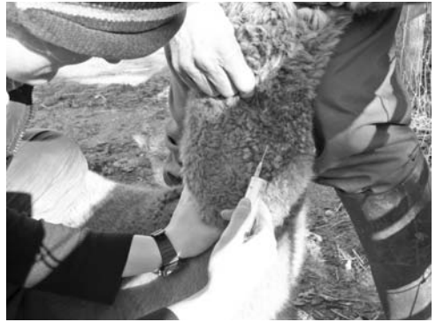
Fig. 8.3. The skin of South American camelids is too thick for the jugular vein to be visualized for use in euthanasia.

Normally, the skin of SACs is too thick to allow the jugular vein to be visualized so inexperienced veterinarians will find this difficult, particularly if the SAC is large and poorly handled (Fig. 8.3). In these instances the SAC can be heavily sedated with 2% xylazine given im (5 ml for a large male llama) or actually anaesthetized by a cocktail of agents given im. The triple-strength barbiturate or