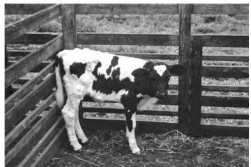
Fig. 3.2. A calf with lumpy skin disease.

This is caused by a Capripoxvirus ( Lumpy skin disease virus ). It is spread by flies. It is seen in European dairy cattle in Africa (Fig. 3.2). There is a generalized disease causing a fever. The whole body is covered in raised plaques which look like hairy tufts. Mortality is low and the disease is self-limiting.