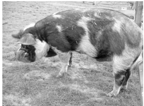
Fig. 10.3. A kune kune boar with large tusks (canines).

stages, antibiotics and NSAIDs will be curative. If the prepuce is severely damaged and the local lymph nodes enlarged, surgical debridement will have to be carried out under GA.