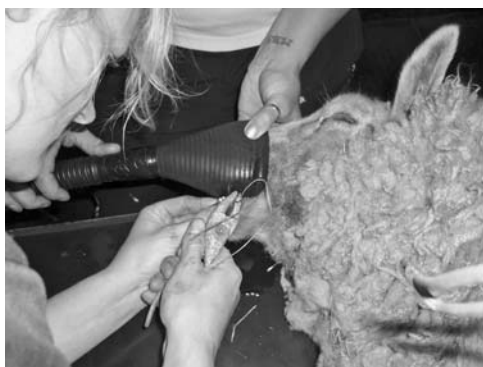
Fig. 6.3. Wiring a fractured mandible in a sheep.

This is a relatively straightforward procedure if an incisor tooth is loose. It is quite easy to fracture the root so elevation is worthwhile. Local anaesthetic (1 ml 5% procaine hydrochloride) should be instilled under the mucosa rostral and caudal to the tooth. The clinician must use judgement on whether removal will be a help to the animal or not. Normally, incisors should be left unless they