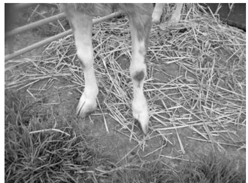
Fig. 6.9. A goat with a digit removed.