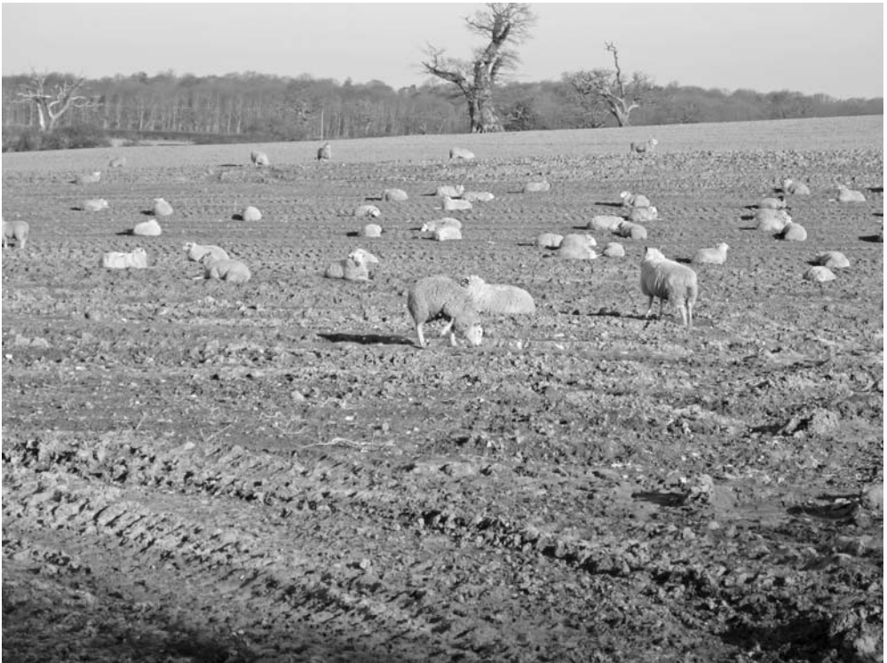
Fig. 6.7. Soil balling is likely when sheep are kept on mud during wet weather and then there is a drying wind.

SOIL BALLING This occurs when sheep are kept on a sea of mud during severe wet weather and then there is a drying wind (Fig. 6.7). The soil will harden between the two claws.