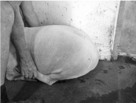
Fig. 6.1. Site clipped for lumbosacral epidural anaesthesia in a sheep.

A tourniquet is applied immediately above the carpal or tarsal joint. Two small rolls of bandage should be inserted either side of the