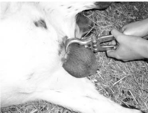
Fig. 6.6. Castration of a goat using a Burdizzo clamp.

There are three basic methods of castration, which also apply to tail docking: surgical; ischaemic by application of a rubber ring; and ischaemic by application of a Burdizzo clamp (Fig. 6.6). All three methods require the use of