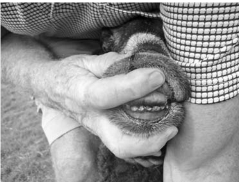
Fig. 6.4. Very worn incisors in a sheep.

The indications for this procedure are rare, but include poisoning cases and the ingestion of foreign bodies, e.g. pieces of cloth. The whole of the left flank caudal to the middle of the rib cage should be clipped and prepared for surgery. Using as little local anaesthetic as possible, a 15 cm line block is placed vertically in the para-lumbar fossa. A 15 cm vertical incision is made through the skin and musculature, including the peritoneum, taking