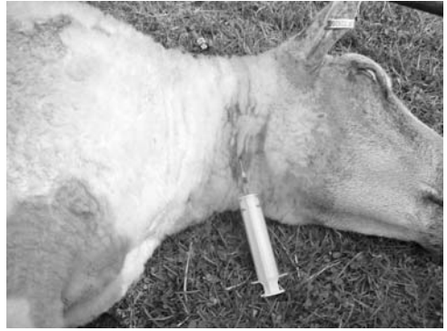
Fig. 6.11. Sheep in lateral recumbency for chemical euthanasia.

This is likely to be the method of choice for pet animals. Veterinarians must obviously not only be 100% welfare conscious but must also be mindful of the owner's concerns. For chemical euthanasia, good advice would be to sedate first using im xylazine with a 1½ in. needle (2 ml 2% solution for an adult animal). The client should be warned that the animal might make a moaning noise. This is not from pain but from the effect of the drug. When the animal is in lateral recumbency, completion of euthanasia can be carried out by injecting 20 ml of triple-strength barbiturate into the jugular vein (Fig. 6.11). The reasoning for this approach is firstly because larger doses of triple-strength barbiturate will be required without prior sedation and second because it is not easy to inject large volumes iv into a standing sheep or goat. It might be argued that a small dose of a solution containing 400 mg/ml quinalbarbitone and 25 mg/ml cinchocaine hydrochloride would be adequate, but this fluid is very viscous, and a large-gauge needle will be required. Also, the practitioner will be left with a part-used bottle of a solution containing the drugs as the