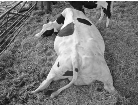
Fig. 4.4. Obturator paralysis in a cow.

A length of embryotomy wire is positioned between the cleats. With an assistant holding the affected cleat with a pair of hoof testers, the cleat is sawn off with the wire at