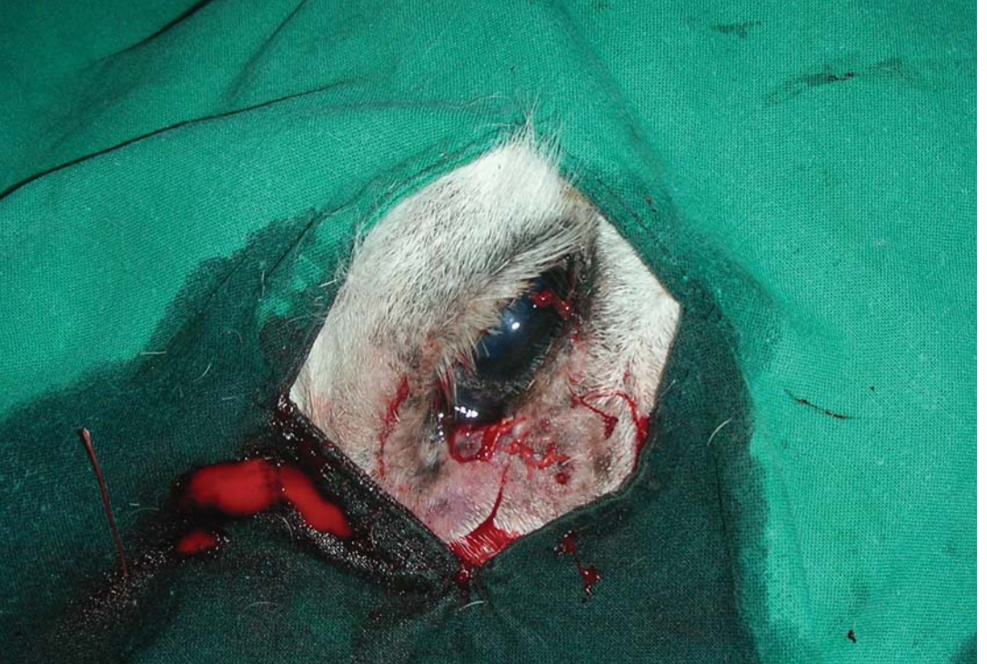
Plate 13. Removal of an eyelid tumour in South American camelids. Surgery to section the third eyelid is straightforward.

Plate 14. Removal of an eyelid tumour in South American camelids. After surgery to section the third eyelid, haemorrhage is minimal.