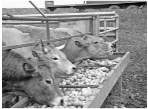
Fig. 4.1. Cattle should not be fed whole potatoes unless they are on the ground.

Normally, diagnosis of choke will not be a problem if the animal has access to potatoes or another root feeding stuff on account of the drooling of saliva and signs of bloat (Fig. 4.1). Confirmation should be obtained that there has been no effort to remove the obstruction with a pipe and therefore there is no danger of perforation of the oesophagus, which will result in a fatal mediastinitis. If the farmer has not tried to remove the obstruction, there are three options: