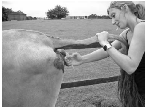
Fig. 3.1. Blood can be taken from the cow's tail vein in a test for Johne's disease.

The main causative organisms are Salmonella typhimurium and S. dublin ; the former is highly zoonotic. The main condition is in calves but these organisms will cause acute diarrhoea and death in freshly calved cows. The faeces