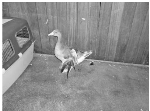
Fig. 11.1. Goose angel wing.

Most deformities are inherited and so breeding stock should be selected carefully. Certain