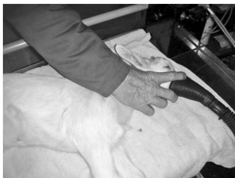
Fig. 6.10. A kid is masked down before disbudding.

This must be performed during the first week of life, but after only the kids have received adequate colostrum. Great care should be taken with the surgery and the anaesthetic. The surgery should take place in a warm environment. The kid is masked down using a halothane or isoflurane and oxygen mixture (Fig. 6.10.). The hair is clipped around the base of both horns. The kid should receive a sub cut injection of 1500 IU TAT, together with im injections of antibiotics and NSAIDs. The horn bud is removed with a scalpel. A specially prepared disbudding iron with a wide aperture is heated to red heat and applied to the horn after the oxygen has been turned off. The iron may have to be removed if the kid shows signs of movement so that the mask with the