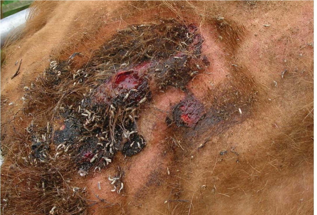
Plate 3. Limb abnormalities in a calf affected by Schmallenburg virus (SBV). Plate 4. Fly strike on the wounded tail head of a cow.