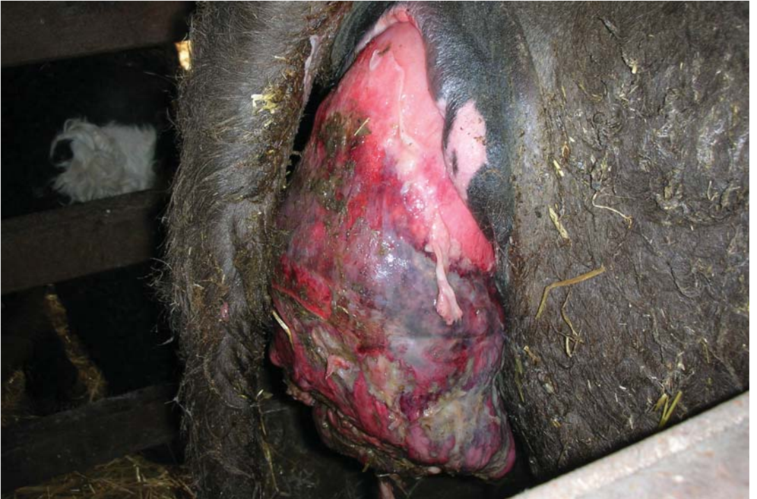
Plate 5. Caesarean section: elevating the calf to the skin incision is not easy. Plate 6. Prolapsed cervix in a cow.