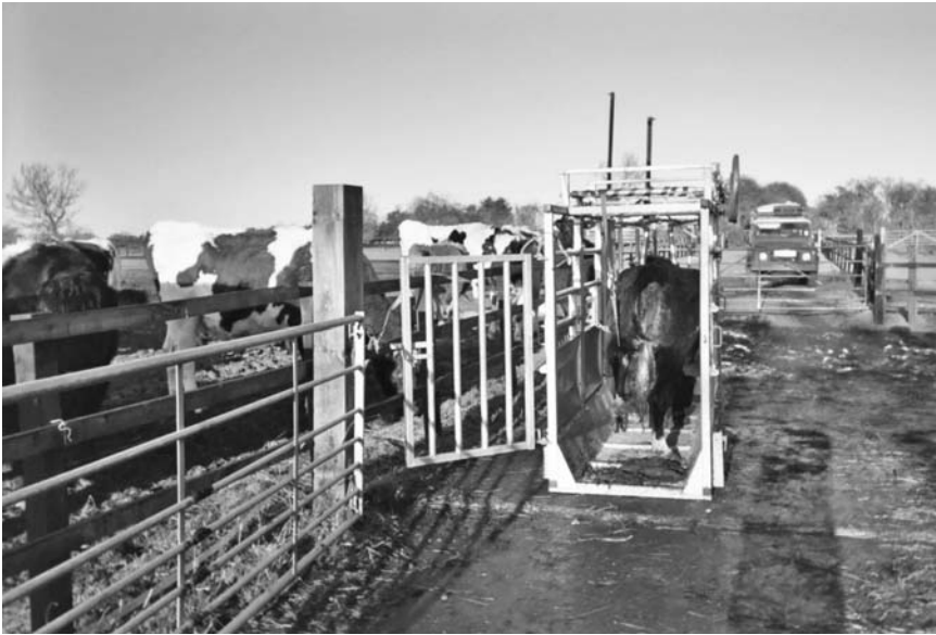
Fig. 4.5. Raising a cow's foot in the crush.

The black area of infection, which often contains very small stones, must be cut out with a hoof knife and the claw and foot bandaged. The animal should be given antibiotics and NSAIDs.