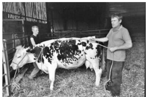
Fig. 4.2. Roeff's method of casting a cow into lateral recumbency.

The cow is cast into lateral recumbency lying on her left hand side using Roeff's method (Fig. 4.2). As she is rolled into full dorsal recumbency her abdomen is vigorously pummelled. The ping from the abomasum will then be heard to the left of the midline. Pummelling is continued as she is rolled on to her right side. The abomasum will be heard to the right of the midline. The cow is then