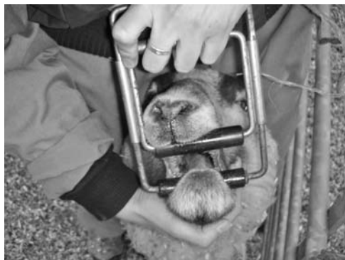
Fig. 6.2. A gag in place for examination (and extraction) of a sheep's cheek tooth.

The tooth to be removed should be examined using a head torch and a gag (see Fig. 6.2). A very small equine dental pick should be used to elevate the gingival mucosa on both the lateral and medial aspects of the tooth. The dental pick should be forced between the tooth and the alveolar socket. Small molar separators should be placed rostral and caudal to the tooth to try to obtain some tooth movement. The tooth should be grasped with a pair of small right-angled molar extraction forceps. A careful, persistent medial/lateral rocking motion should be commenced, and when the tooth is loose it should be elevated using a long pair of artery forceps as a fulcrum. There is no need to pack the alveolar socket as in the author's experience these fill with granulation tissue