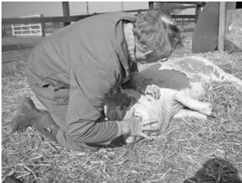
Fig. 10.2. Tooth examination of a pig under general anaesthetic.