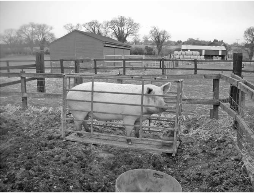
Fig. 10.1. An adult pig well secured in a crate.