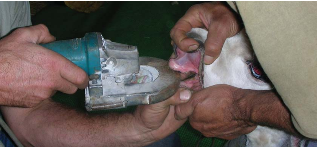
Plate 11. Vaginal prolapse in a sheep.